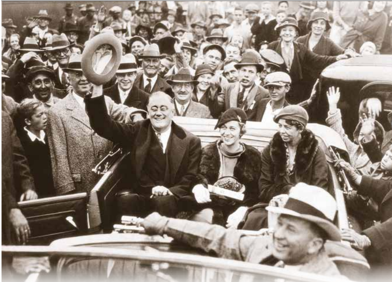
Above: Presidential candidate Franklin Delano Roosevelt is greeted warmly by a crowd of supporters during a campaign stop in Atlanta during the 1932 presidential election.