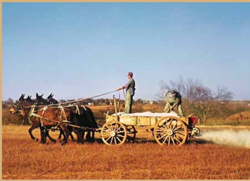
Above: FSA photographer Marion Post Wolcott took this picture of a four-mule team spreading fertilizer on a field of oats in southeastern Georgia. There were fewer, but larger, farms by the end of the Great Depression.

In Georgia and other states of the South, the New Deal sped up the process of modernization. By the end of the 1930s, Georgia agriculture was changed permanently. Most of the sharecroppers who had provided the workforce for Georgia's cotton crop had been pushed off the farms. Farmers had finally gotten away from their focus on cotton and had begun to plant other crops. New Deal programs and state programs had improved Georgia's transportation system, making it faster to get crops such as fruits and vegetables to market before they spoiled. Many small farmers had also lost