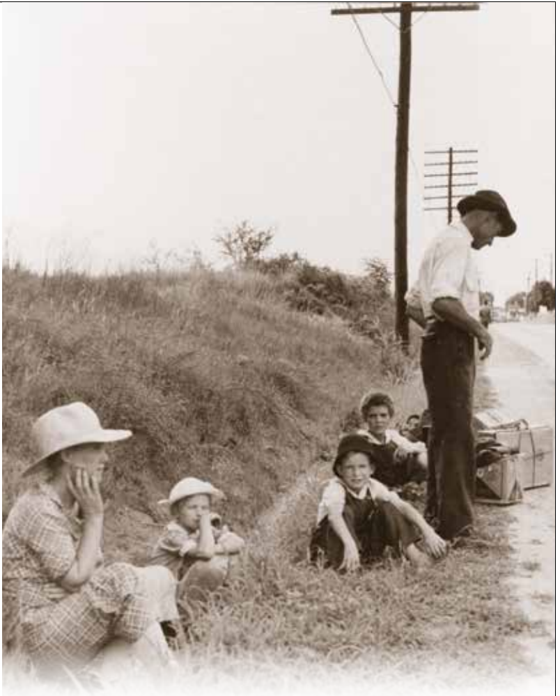
Above: Unemployed workers moved from town to town and state to state looking for work. This family had hitchhiked to Macon from Alabama, only to discover that the father could not work there without a permit.

By 1932, as the economy continued to get worse, many Americans were becoming uneasy. By 1931, Georgia had a family farm income of around $675 per year. Many families had so little cash that they operated by bartering (trading) goods rather than using cash. Georgia textile workers made less than half what those in the North made. Many Georgians lived in difficult, if not desperate, circumstances. They wanted a change, and the upcoming election provided hope of that.